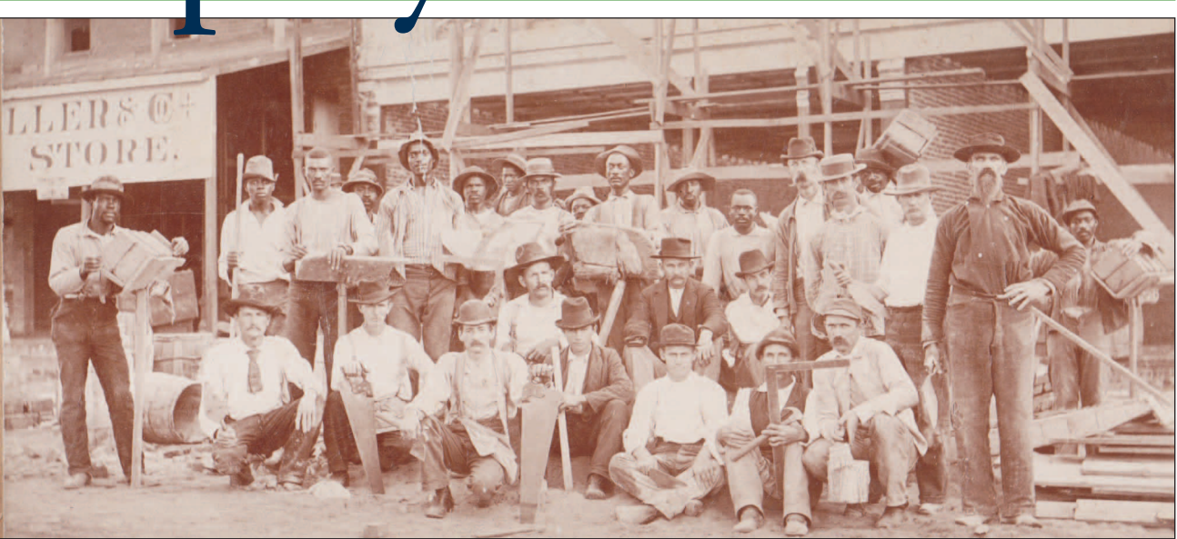
Members of the construction crew of a Ripley downtown building on Main Street hold implements of their trades. The picture, taken in the early 1900s, is one of 26,000 pictures in Billie Morris' collection of Lauderdale County's past.