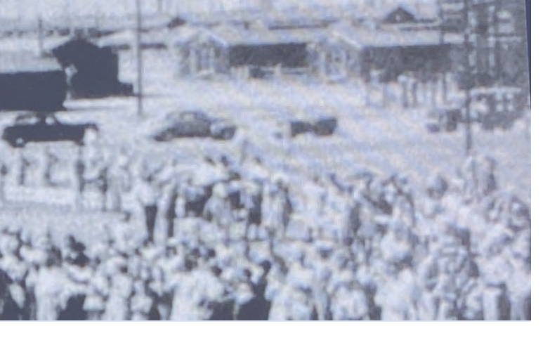
The Dyersburg Army Air Base operated from 1942 to 1945.