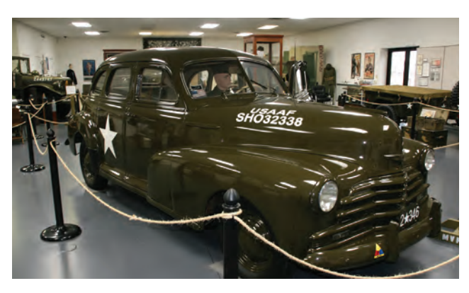
The Veterans' Museum is filled with memorabilia from several wars, including a Chevrolet staff car from World War II.

More from Ripley Power and Light, pages 20-21