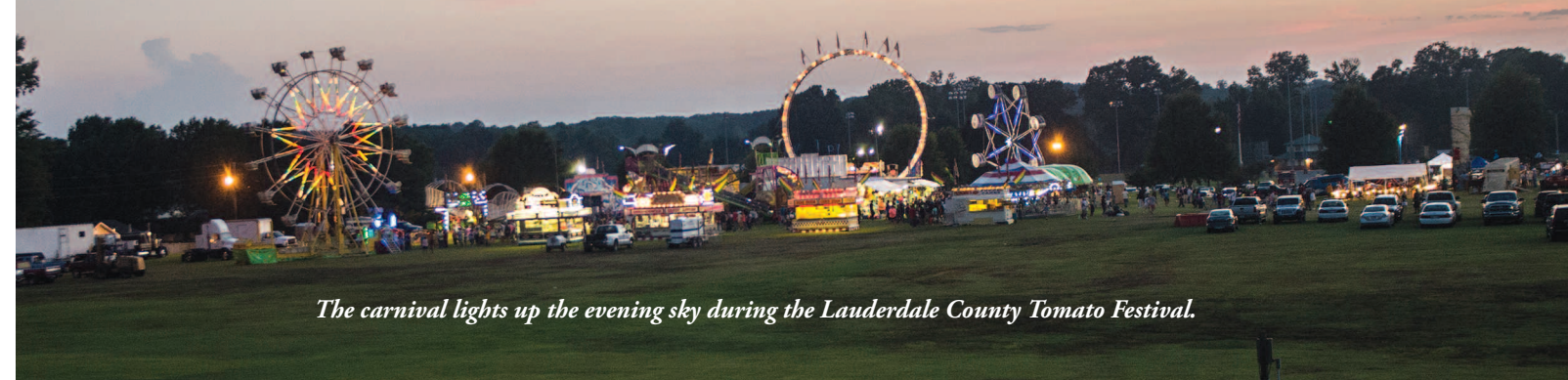
The carnival lights up the evening sky during the Lauderdale County Tomato Festival.