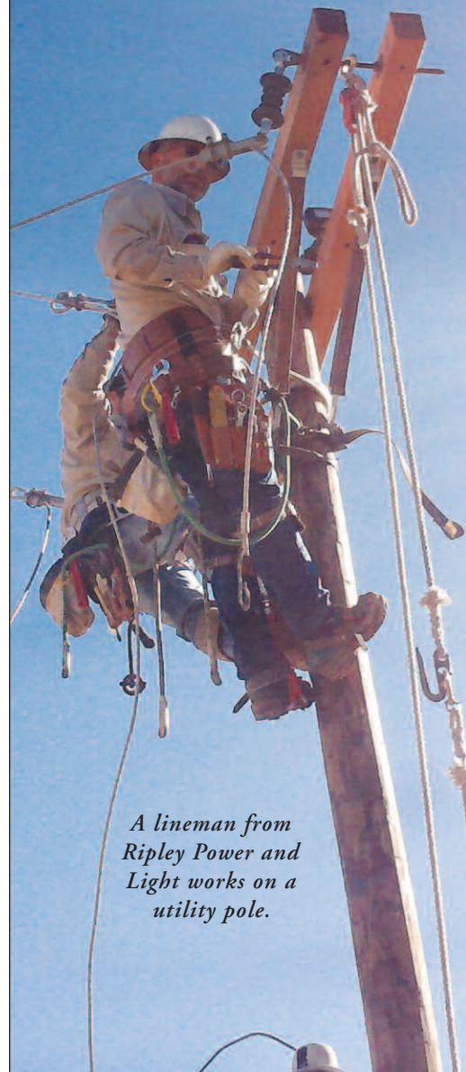
A lineman from Ripley Power and Light works on a utility pole.

"We're honored to receive the diamond RP 3 designation," said