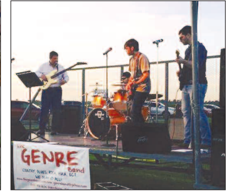
This year's tomato festival, clockwise from above left, will include the world's largest tomato sandwich, tomatoes canned and cooked in many different ways, entertainment by the Genre Band and arts and crafts with a tomato theme.