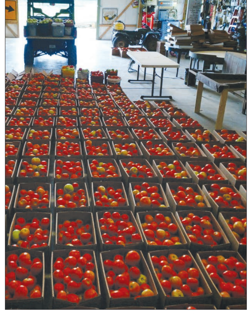
Boxes of fresh tomatoes from Joe McNeil's farm are ready for market.