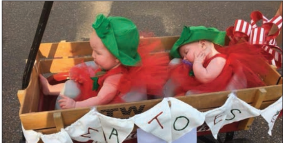
It's hard to stay awake in the festival's kid's parade.

he Lauderdale County Tomato Festival is back! After it was cancelled last summer because of the COVID-19 pandemic, the two-day annual event will be celebrated this year July 9-10 in Ripley City Park.