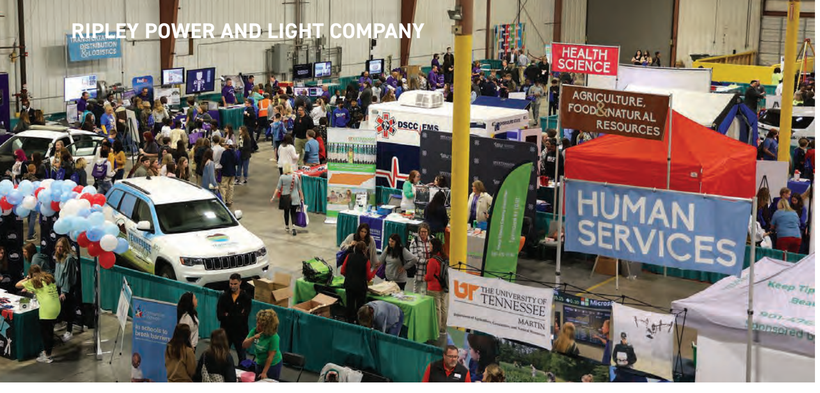
The 2022 West Tennessee Pathways2Possibilities was held in Ripley Power and Light's multipurpose complex.